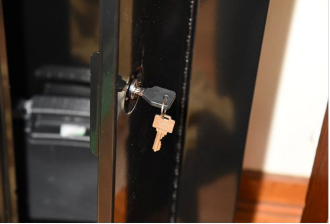
Open Gun Safe with ammunition inside